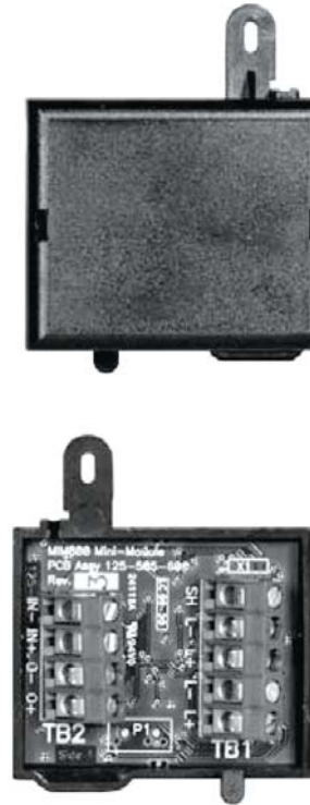
Fig. 1 EV-Mini IP Mini-Input Module